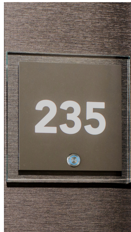
Corridor signage by others

The K-R1-VWW-0000 is installed into the corridor signage (by others) into a 3/4" cut-out. It is recommended a max door signage panel thickness of 0.4" (10mm).